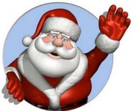
Photo With Santa