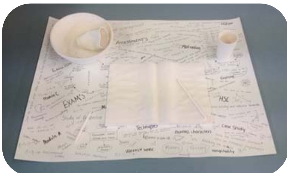
Ashleigh Farrah Study Space 2014