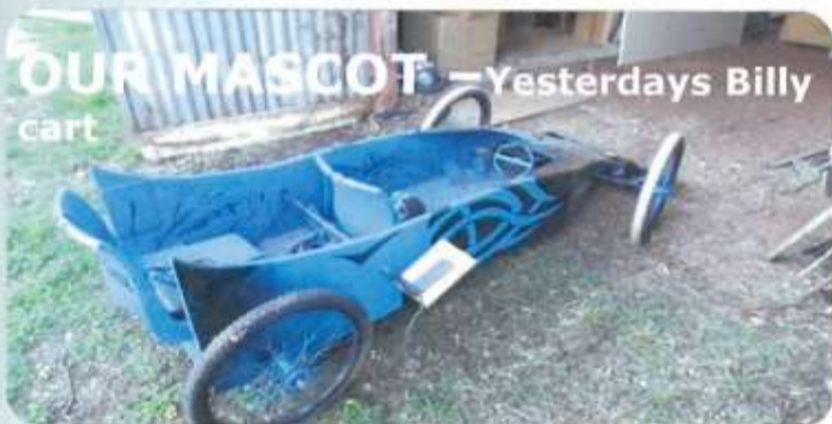
OUR MASCOT - Yesterdays Billy cart