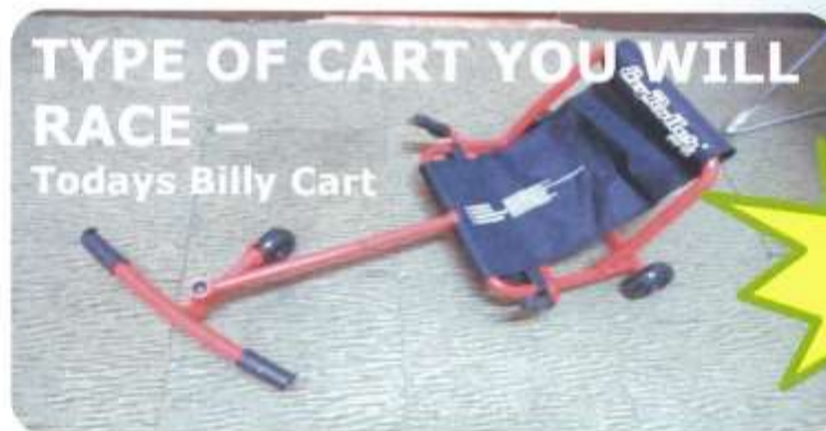
TYPE OF CART YOU WILL RACE - Todays Billy Cart