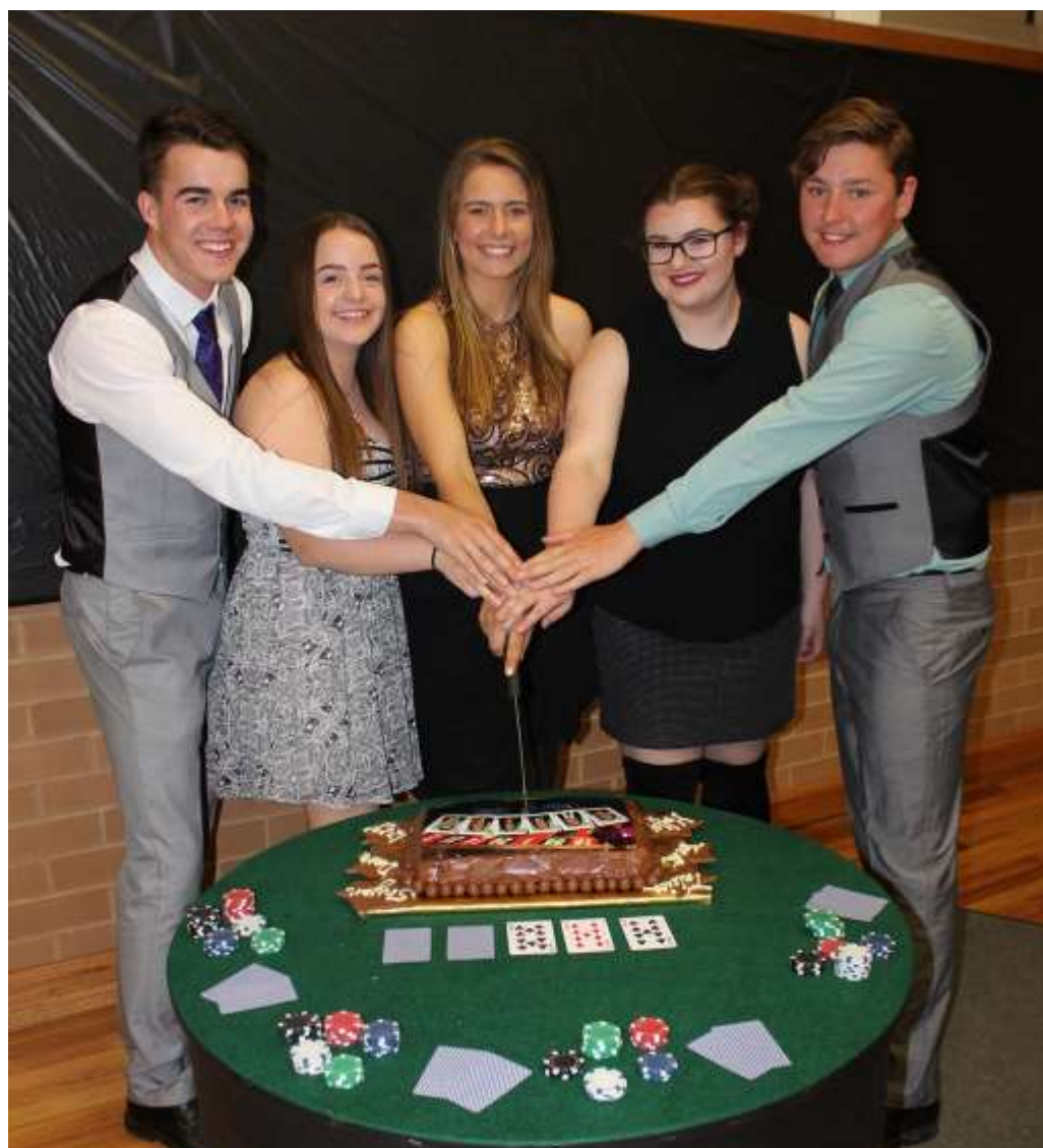
Our 2016 Graduating Class cut their cake at the Banquet.