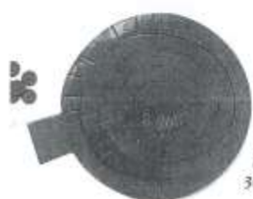
Mehen, the snake game, was popular in Egypt before 3000BC.