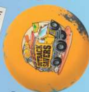
Mud Splat Handball

For more tips, videos and activities to stimulate your child's interest in money skills, head to The Beanstalk at commbank.com.au/youthsaver