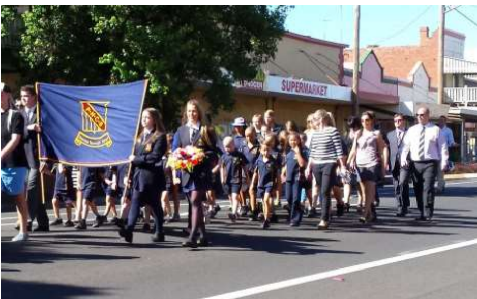
Thank you to the Peak Hill Central School staff and students who marched on ANZAC Day 2016

On Thursday and Friday our Stage 6 students were able to work with members of the Belrose Rotary Club. This long standing program involves students participating in an interview scenario, each student receives detailed feedback about their strengths and areas for development as they transition to further study and employment post schooling.