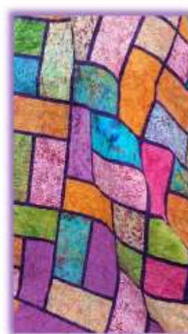
Patchwork Quilt and other Raffles