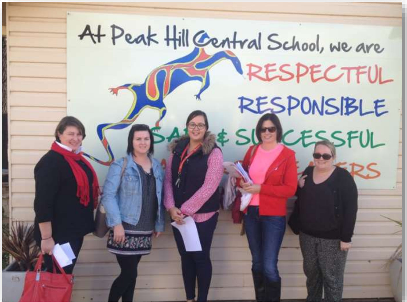
Collaboration equals sharing skills and knowledge

School Learning Support Officers worked on literacy and numeracy strategies, students' health and wellbeing initiatives and ways to increase their effectiveness in supporting students.