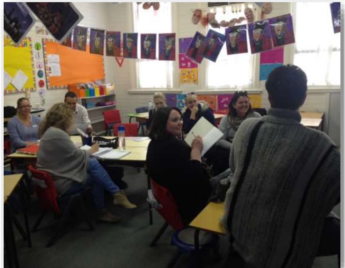
Innovation equals exciting student experiences

Thank you must also go to Peak Hill Central School for hosting this event and providing the wonderful catering.