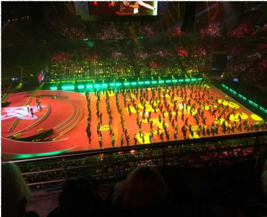
In front of a huge crowd our girls perform with students from all over the state.

A fter auditioning earlier this year, students from our Aboriginal Dance Group were again successful in being selected to participate in the 2017 Schools Spectacular.