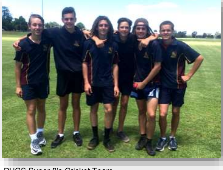
PHCS Super 8's Cricket Team

The behaviour and sportsmanship of these young men were world class. They showed great respect for the opposition and event organisers. A genuine credit to themselves, PHCS and the greater community.