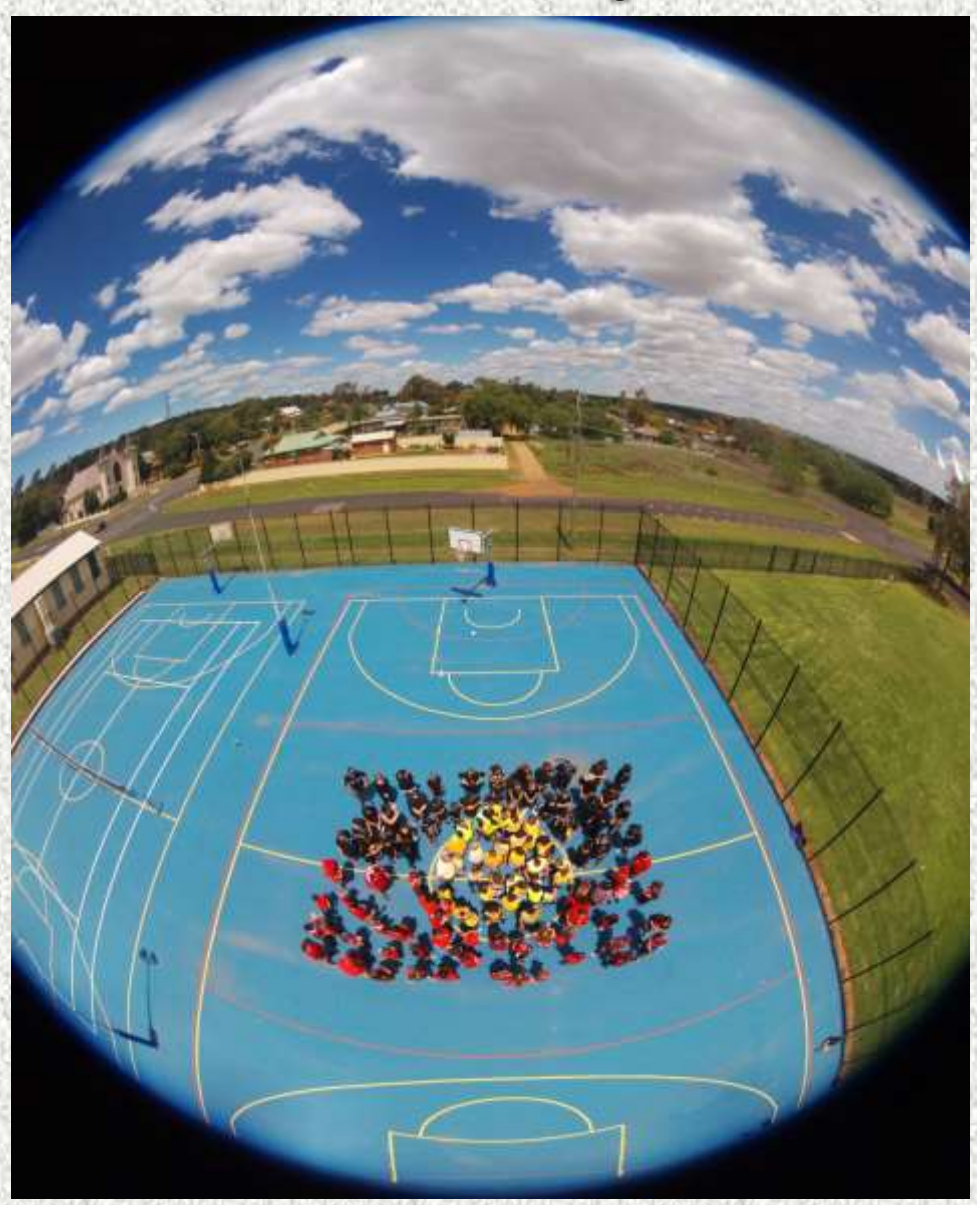
One hundred and ten PHCS students and staff make a human Aboriginal flag to end a week of NAIDOC celebrations.

A special thanks to Miss Dempsey for coming in to take the aerial photograph with a drone from 100m up!