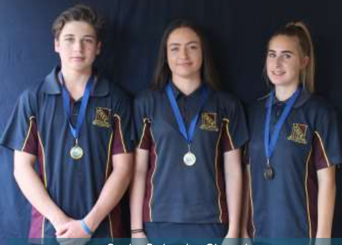
Senior Swimming Champions