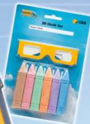
3D Chalk Set

Did you know that approximately one in five parents are trying to teach their children about cashless transactions and digital money management? CommBank research shows parents are alternating between cash and online bank transfers when giving their children pocket money, and actively demonstrating 'tap and go', online banking, mobile applications and how ATMs work. For more information and tips on financial education for kids, visit The Beanstalk on commbank.com.au/beanstalk