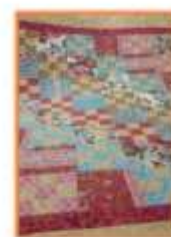
Patchwork Quilt and other Raffles