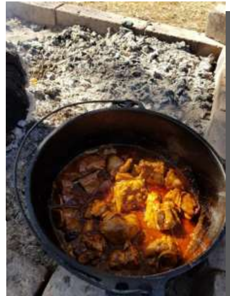
The camp oven was used to prepare a fabulous big lunch for the students..