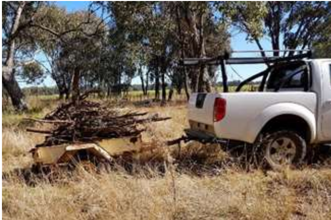
Pictured left is the trailer load of sticks and timber so the tractor could slash the grass.