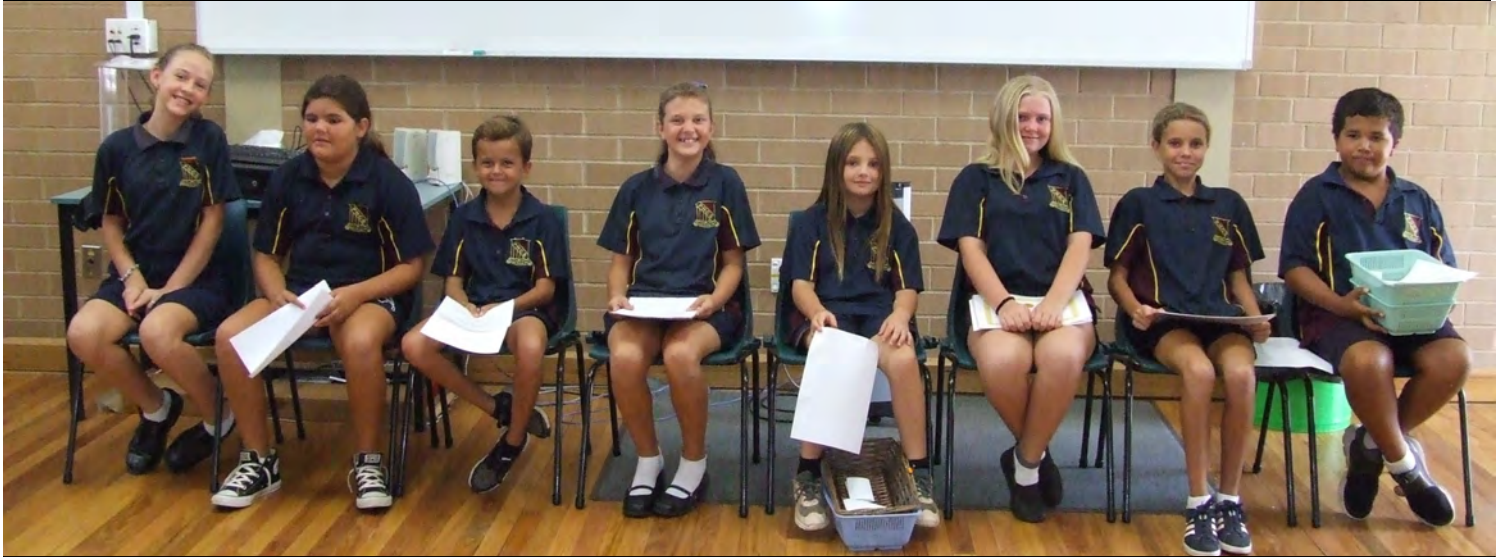
Year 5/6 Leading the Assembly