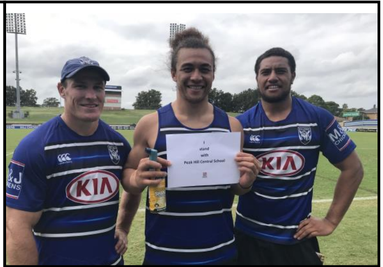
Canterbury Leagues Club