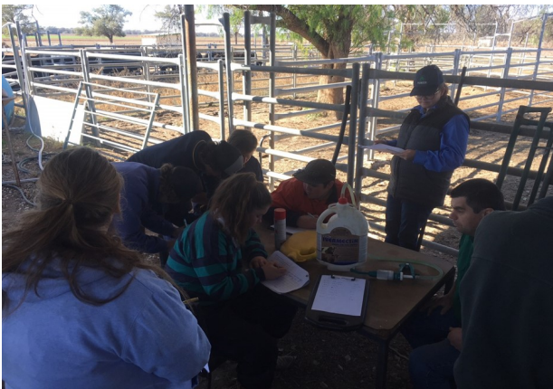
Chemical application data collection exercise