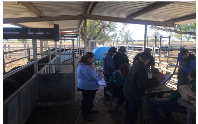
Calibrating the gun and recording results