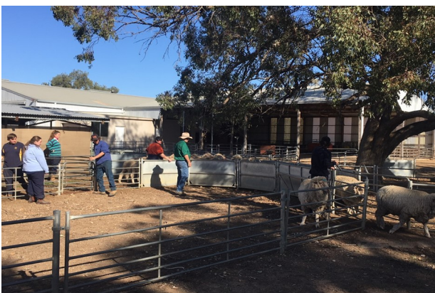
Drafting blue raddled wethers out of mob