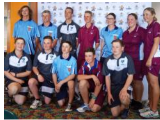
Australian Merit Side 2019